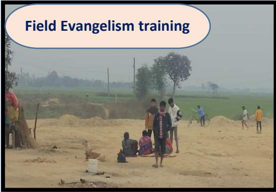
Field Evangelism training