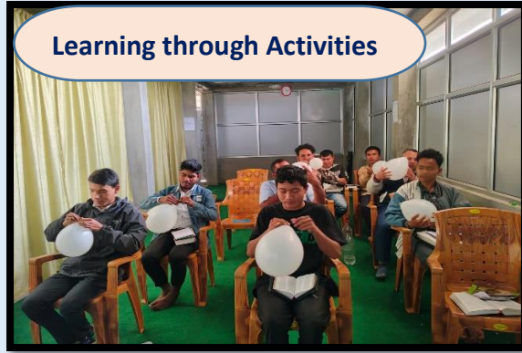
Learning through Activities

This training was completed by 13 th March 2024. They were taught on 25 different subjects along with field exposures, Skill (Music) training, practical sessions, learning through activities etc. It was a big exposure & training for them. They will be commissioned for ministries on 2 nd April and will be placed in the new fields. They will also be enrolled for the next level distance education courses simultaneously. The REACH training aims to raise many more committed disciples as Evangelists to take the gospel to different unreached places & the called one as Missionary Pastors (Active Church Harvesters) to establish Biblical Model Churches.